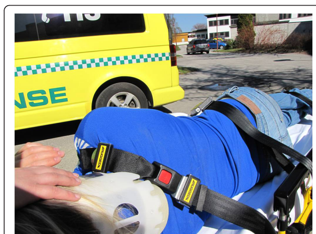
Figure 1 The lateral trauma position. A patient has been positioned in the lateral trauma position on a stretcher. Observe that the most cephalic stretcher belt has been placed above the shoulder to prevent forward movement on the stretcher.

After checking airways and breathing, the unconscious trauma patient is carefully rolled to a lateral recovery position, maintaining manual in-line stabilization with the c-collar in place (see Table 1 and Figure 1). The method was described in the EMS protocols, a teaching video was made, and training and retraining was instituted locally. PHTLS Norway has adopted LTP in their educational program (Sindre Mellesmo, personal communication). In addition to being demonstrated in PHTLS courses, LTP is now part of the written protocols in some Norwegian EMS and is described in the